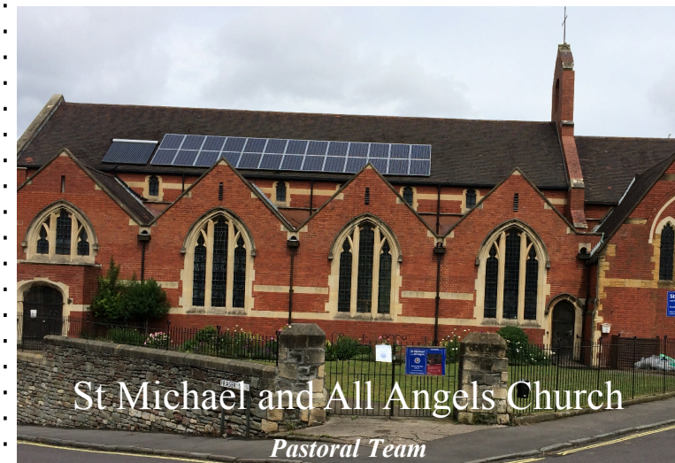
St Michael and All Angels Church